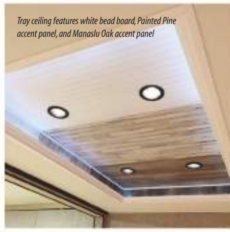
Tray ceiling features white bead board, Painted Pine accent panel, and Manaslu Oak accent panel