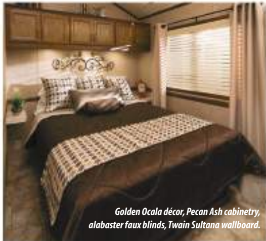
Golden Ocala décor, Pecan Ash cabinetry, alabaster faux blinds, Twain Sultana wallboard.