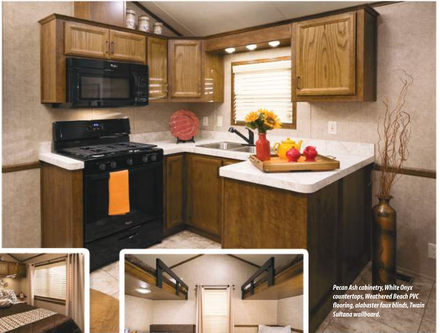
Pecan Ash cabinetry, White Onyx countertops, Weathered Beach PVC flooring, alabaster faux blinds, Twain Sultana wallboard.