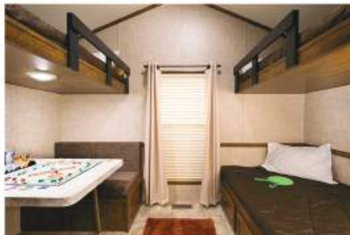
Bunk room features, Pecan Ash cabinetry, White Onyx laminates, collapsible table, alabaster faux blinds, Twain Sultana wallboard.