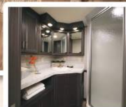
Graystone cabinetry, Carrara Bianco countertops, Coventry Flax wallboard, neo angled shower